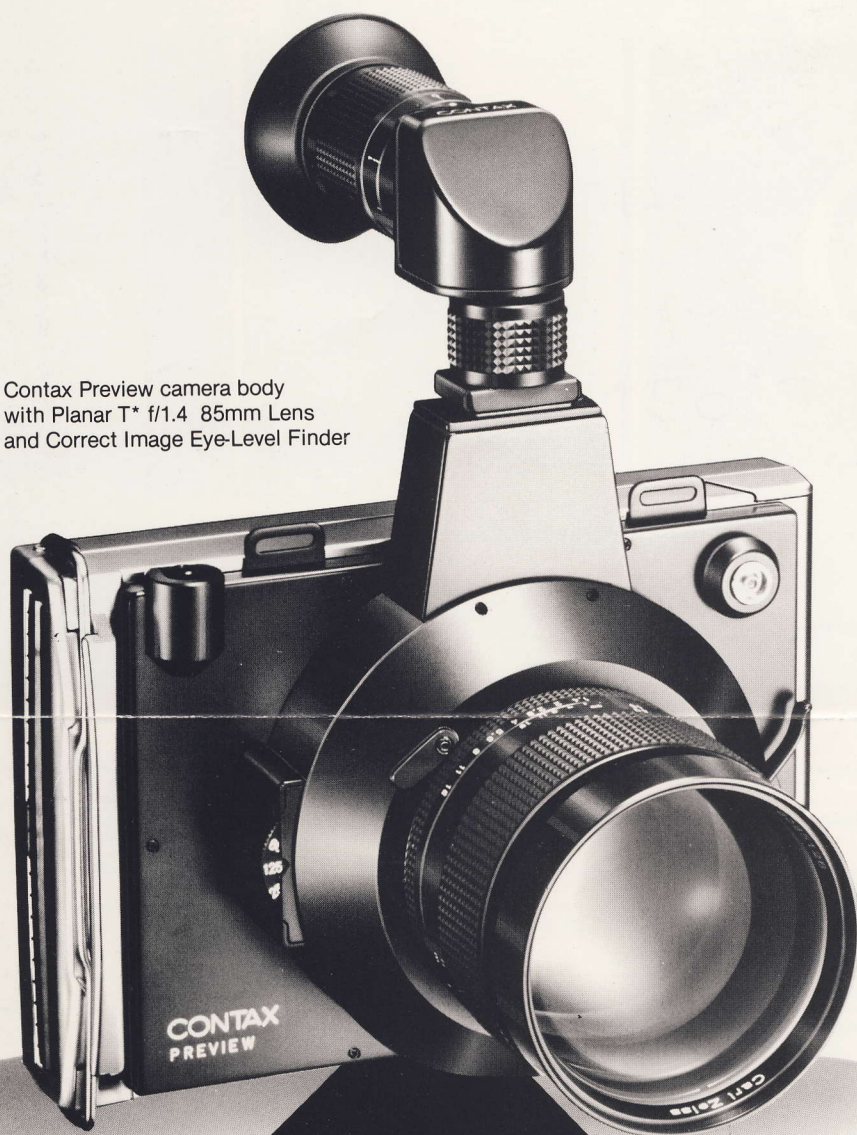
Contax Preview camera body with Planar T* f/1.4 85mm Lens and Correct Image Eye-Level Finder

The CONTAX PREVIEW Camera with Built-in Polaroid Back is a special "accessory camera" designed for the professional Contax user. Accepting Polaroid film packs, the CONTAX PREVIEW allows the photographer to "pre-view" the photograph by taking an identical, 35mm-size Polaroid shot. This supplementary camera is a vital convenience for pre-checking such factors as exposure compensation or lighting. The camera body is extremely simple in construction, corresponding to the Polaroid Back CB102. Attached to this back is a shutter-equipped lens mount for all Contax/Yashica bayonet mount lenses. The shutter operates at Bulb (B) and 1 to 1/1000 sec. speeds, with X-synchronization at 1/125 sec. A single-lens reflex design, the camera has a waist-level type viewfinder showing 95% coverage of the actual film area. An optional CONTAX PREVIEW right-angle finder is available for correct image eye-level use. Image size is identical to the standard 35mm frame (24 x 36mm format) on the instant-developing Polaroid film. This allows the photographer a clear, precise image which will be identical to the final shot. The finished Polaroid prints can be used simply for checking the photo situation, or for design/layout work or as teaching aids. In determining such factors as ambient light, or electronic flash exposure, shadow effects, perspective, etc., the CONTAX PREVIEW is invaluable since all Contax/Yashica bayonet mount lenses can be attached.